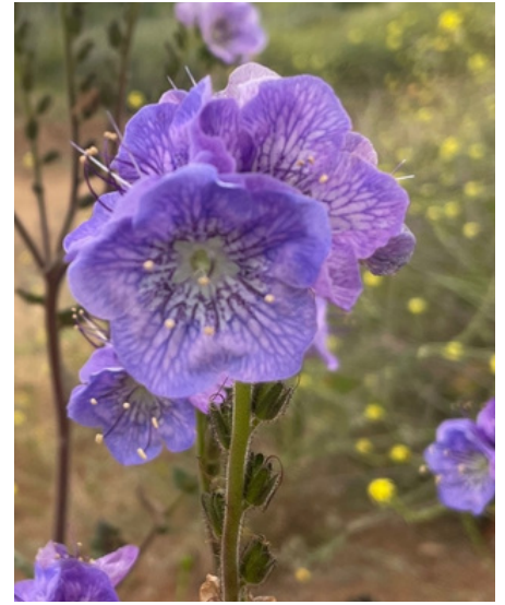
2. Largeflower Phacelia