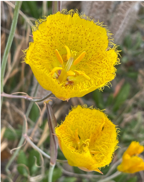
3. Calochortus weedii