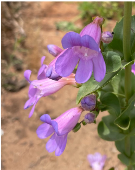
6. Penstemon spectabilis