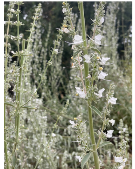
8. Salvia apiana.