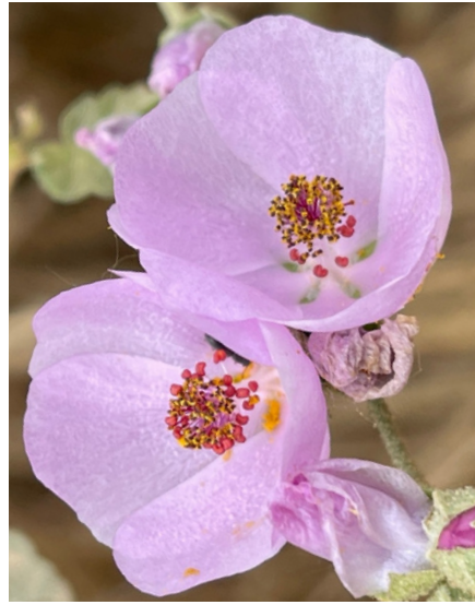
1. Malacothamnus fasciculatus

Scientific names are located under each image.