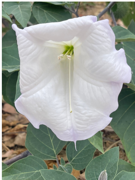
7. Datura wrightii