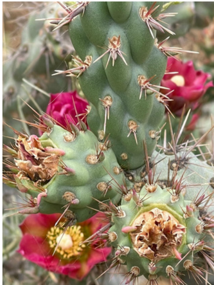
4. Cylindropuntia prolifera